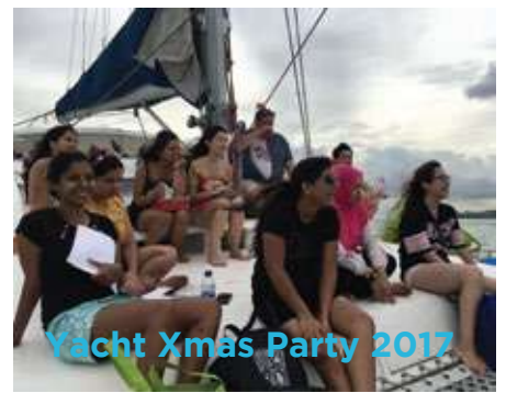
Yacht Xmas Party 2017