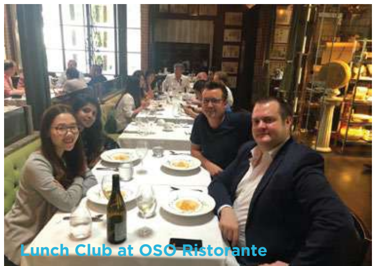
Lunch Club at OSC Ristorante