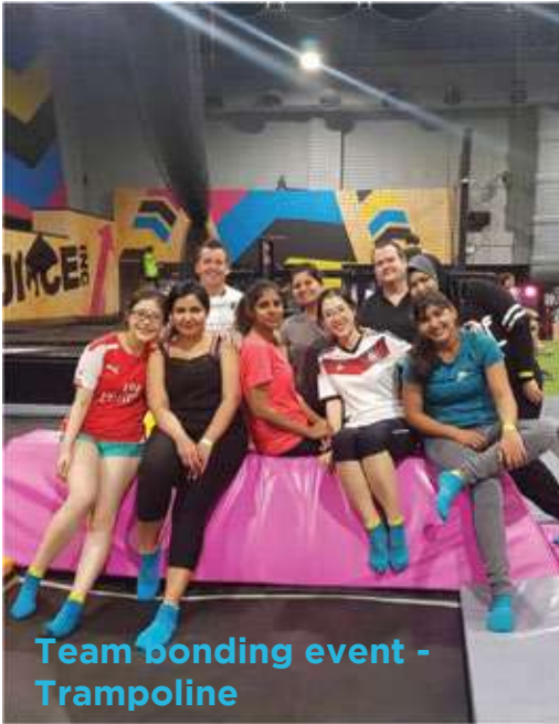
Team bonding event - Trampoline