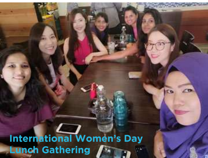
International Women's Day Lunch Gathering