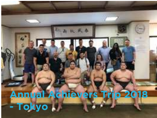
Annual Achievers Trip 2018 - Tokyo