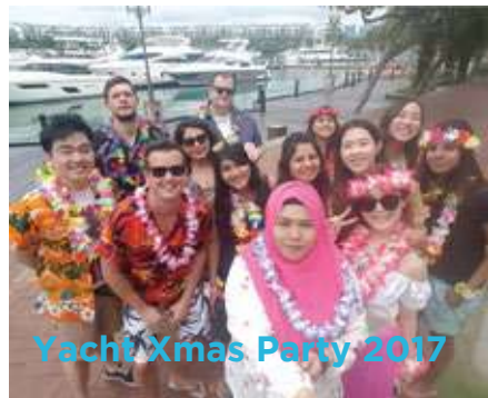
Yacht Xmas Party 2017