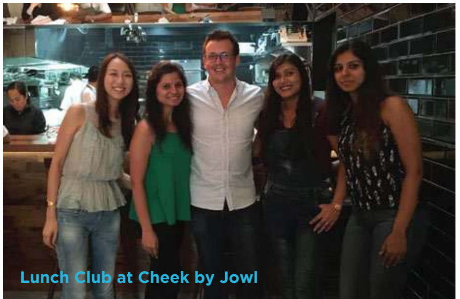
Lunch Club at Cheek by Jowl