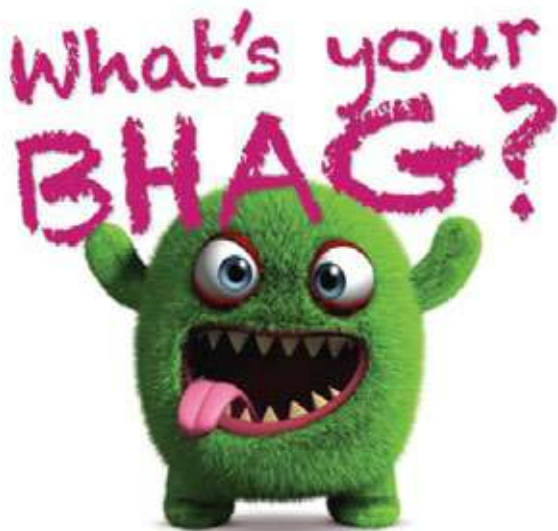
Big. Hairy. Audacious. Goal.

Our goal unifies our team, sets us in the right direction and let us know when we have reached the finish line.