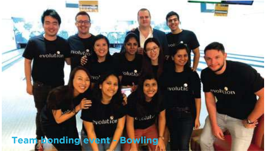
Team bonding event - Bowling